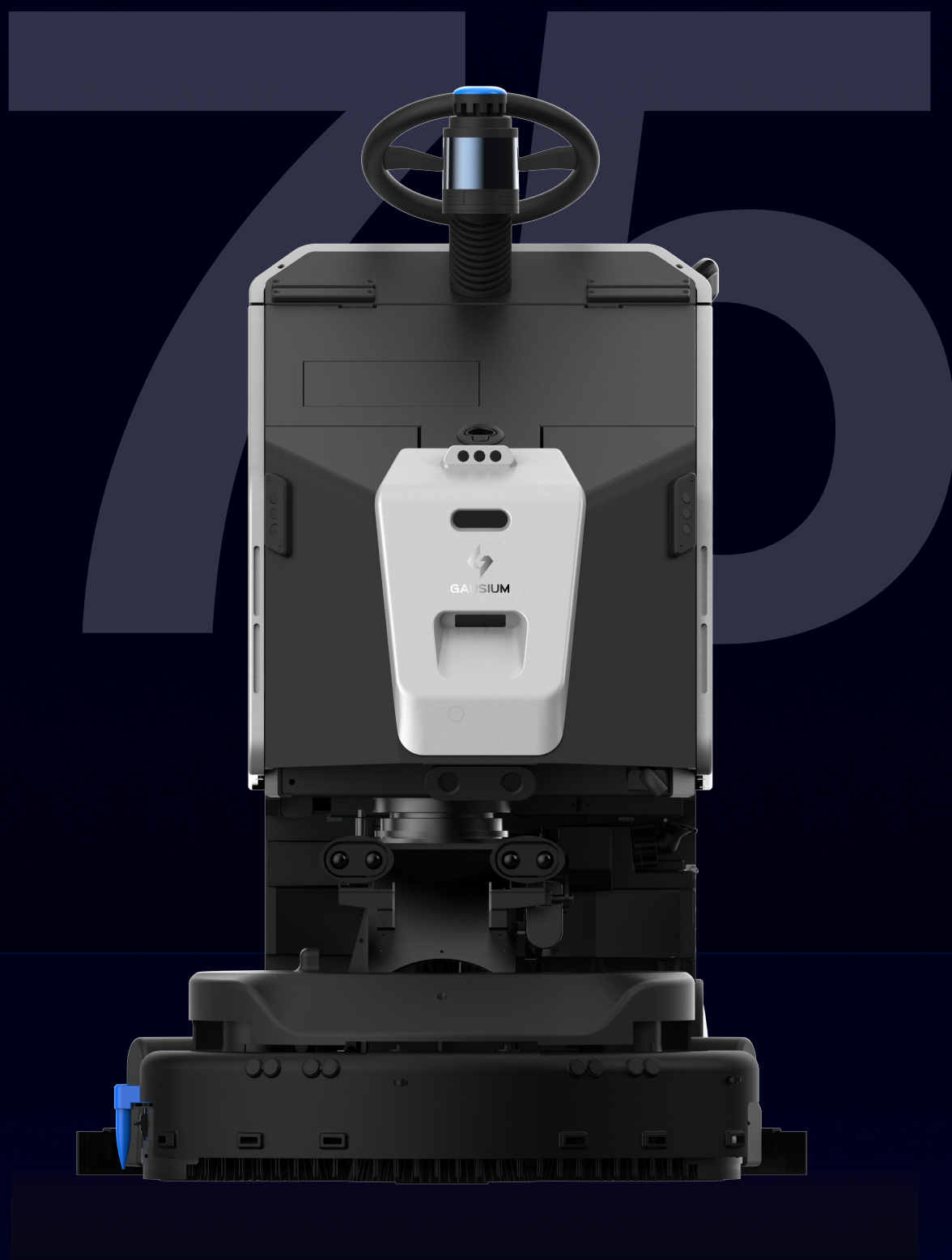
Scrubber 75 (EU-specific Configuration) Heavy-duty Cleaning with Best-in-class Sensing